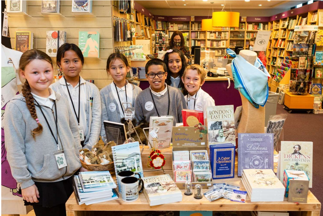
Children take over the shop on Takeover Day 2021 at The National Archives

This resource aims to offer insight into what families want from museum shops and some top tips about how museums can make these amenities more family friendly.